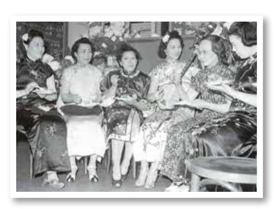
A Chinese Women's Club in Detroit, 1942