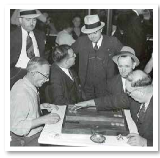
Greek Men in a Detroit Coffee House, 1939

In the post-war years, strict immigration laws had been periodically relaxed to accommodate displaced persons and refugees from various parts of the world. Europeans displaced by World War II and the Cold War were drawn to Detroit. Similar factors played an important part in attracting thousands of Arabic, Hispanic, Asian, Chinese, Vietnamese, Korean, and Japanese immigrants.